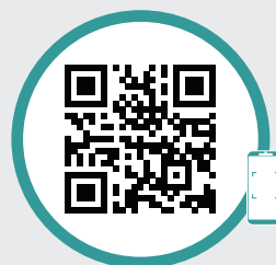
Exhibit Space is Open for Reservation